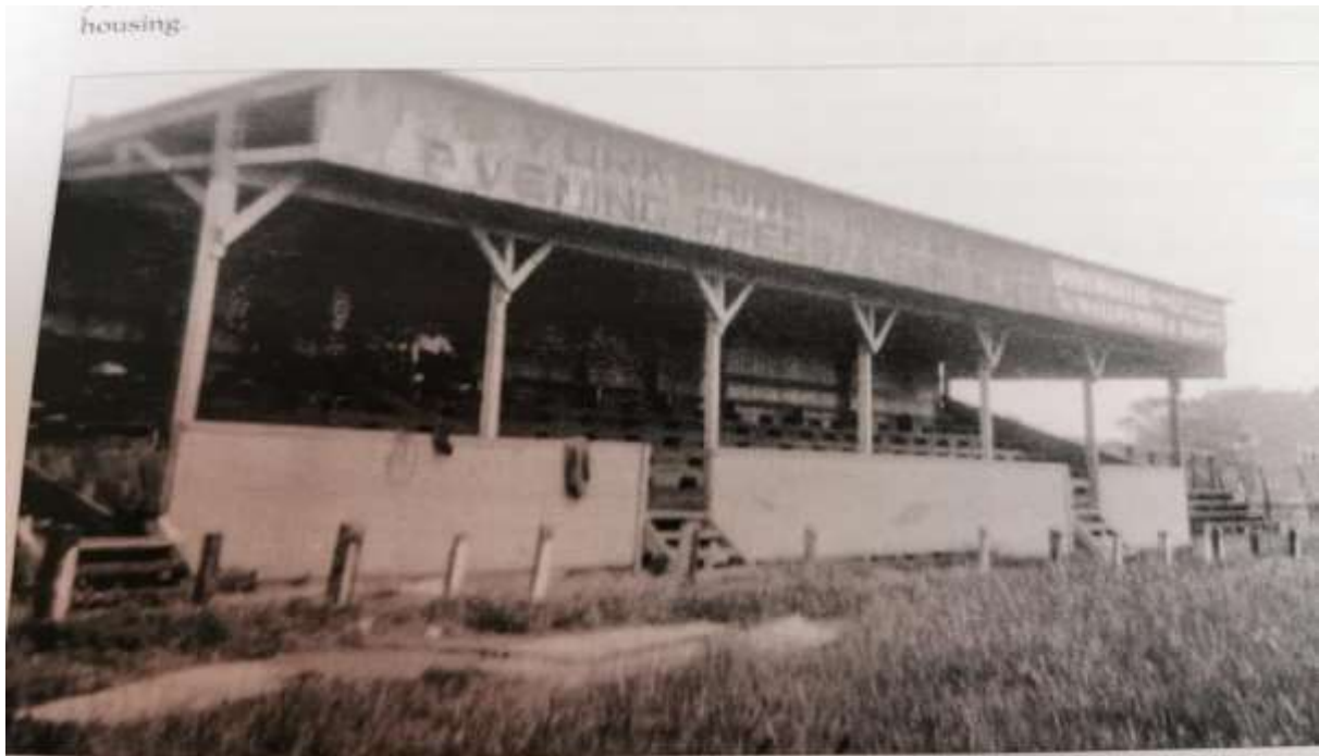
Covered Stand at Gatefulford Ground

Concerned by poor support at Fulfordgate during their third season in the Football League, York City decided, in 1932, to relocate to the more central Bootham Crescent, which had been vacated by York Cricket Club.